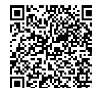
Tested By: Chris Farman Scientist Date: 09/30/2025

This product or substance has been tested by KCA Laboratories using validated testing methodologies and an ISO/IEC 17025:2017 accredited quality system. Values reported relate only to the product or substance tested. The reported result is based on a sample weight. Unless otherwise stated, results of tests performed on all quality control samples met criteria for acceptance established by KCA Laboratories. KCA Laboratories makes no claims as to the efficacy, safety or other risks associated with any detected or non-detected amounts of any substances reported herein. This Certificate of Analysis shall not be reproduced except in full, without the written approval of KCA Laboratories. KCA Laboratories can provide measurement uncertainty upon request.